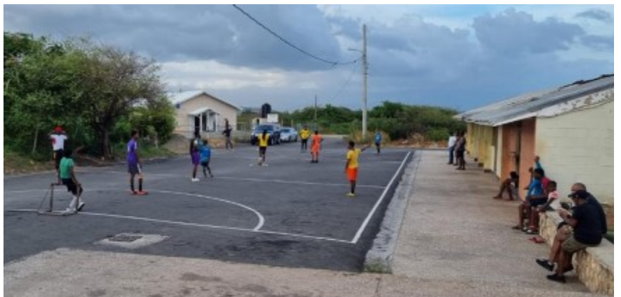
Residents watch 6-a-side teams from Hellshire Park & Seafort in a warm-up game on Aug 19

The AHLC Youth and Sports Committee is encouraging all communities to organize a team for the Heroes Day Sports & Funday. Activities will include football, netball and domino matches plus cricket clinics with the SDC.