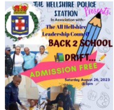
Students enjoyed packages of useful supplies, treats and fun activities at the well attended event